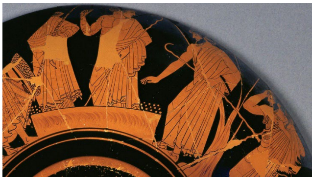
Source 1: Scene from the Wine Cup with the Suicide of Ajax (detail), about 490 B.C., attributed to the Brygos Painter. Red-figured kylix made in Athens. Terracotta, 4 7/16 in. high x 12 3/8 in. diam. The J. Paul Getty Museum, 86.AE.286