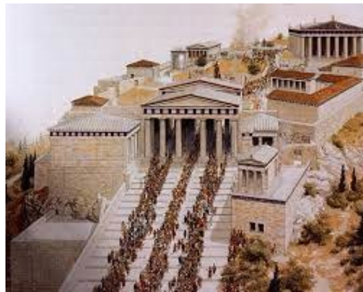
Source 2: Artists impression of the Panathenaic procession into the Acropolis in the 5th century BCE.