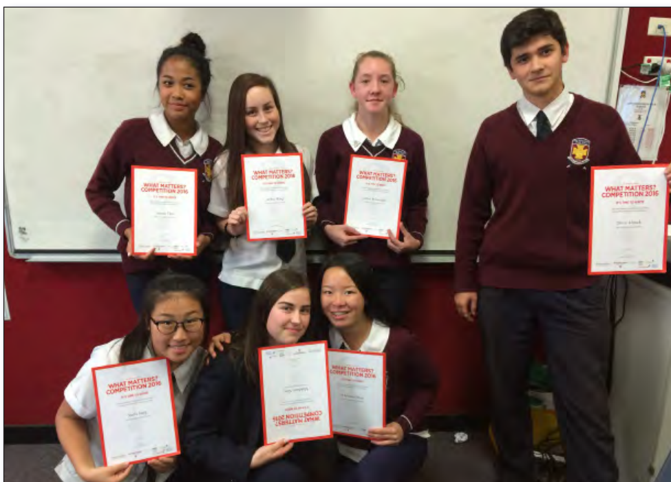
JEHS students with their What Matters? Certificates