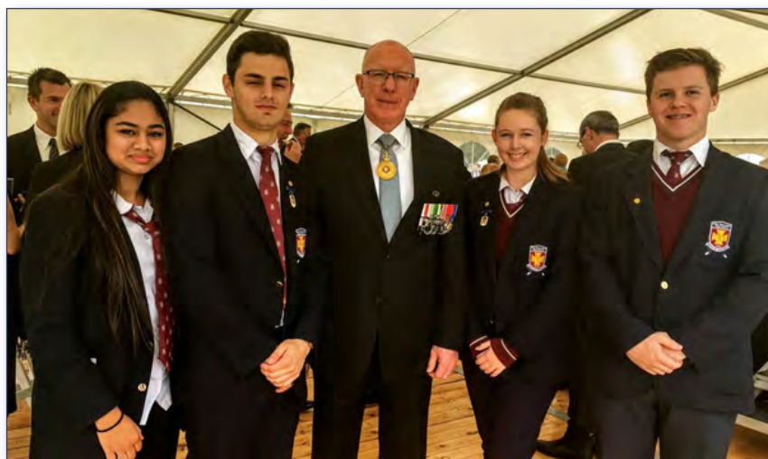
Our 2016 Captains and Vice Captains with the Governor of NSW, His Excellency General The Honourable David Hurley AC DSC (Ret'd)

In speaking about the Industrial Technology students and their works, in many ways, this should also be under 'creative success', but none-the-less, they have produced some truly outstanding work. Due to the quality of the work here, many of our students' works were chosen to represent quality work to be seen as an