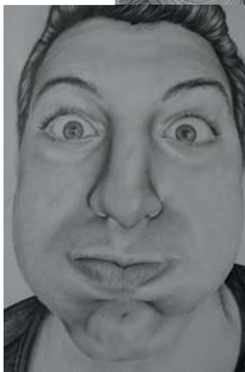
LEFT: I'm not holding my breath!